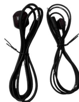
IR Baster & IR Receiver