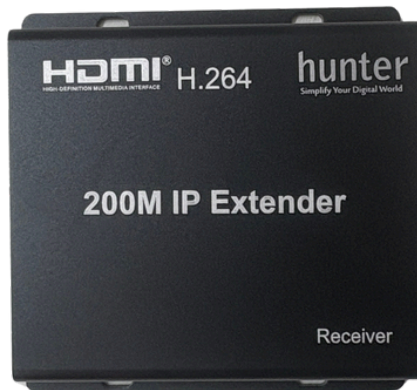
Hunter RX Extender