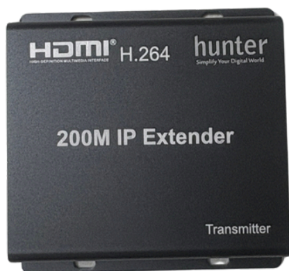
Hunter TX Extender